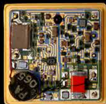
MSA 5 W