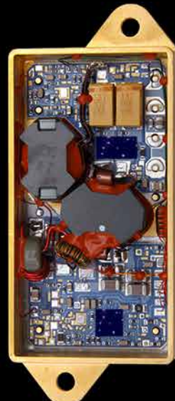
MFX 50 W