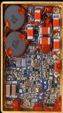
MHV 15 W