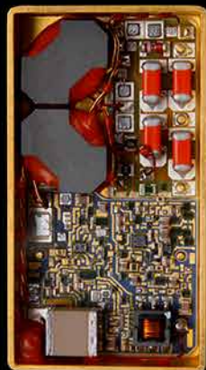
MTR 30 W