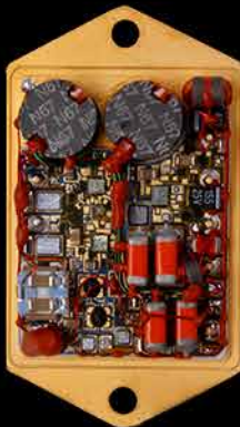
MHF+ 15 W