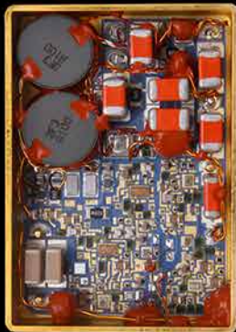
MWR 35 W