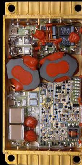
MFL 60 W