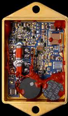
MFK 25 W